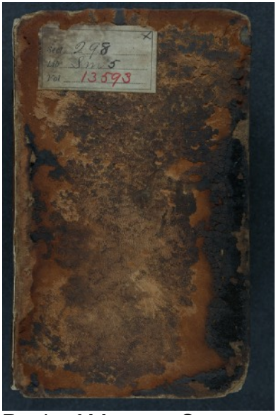
Book of Mormon Census